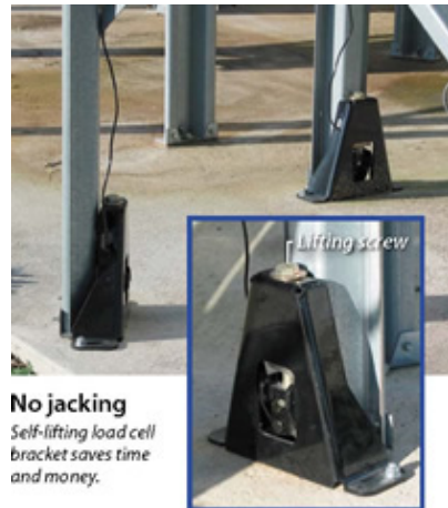
No jacking Self-lifting load cell bracket saves time and money.

The all-weather console and load cells are designed for reliable operation under extreme conditions.